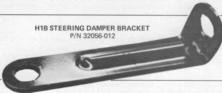
H1B STEERING DAMPER BRACKET P/N 32056-012

This reinforcing bracket must be installed to prevent flexing.